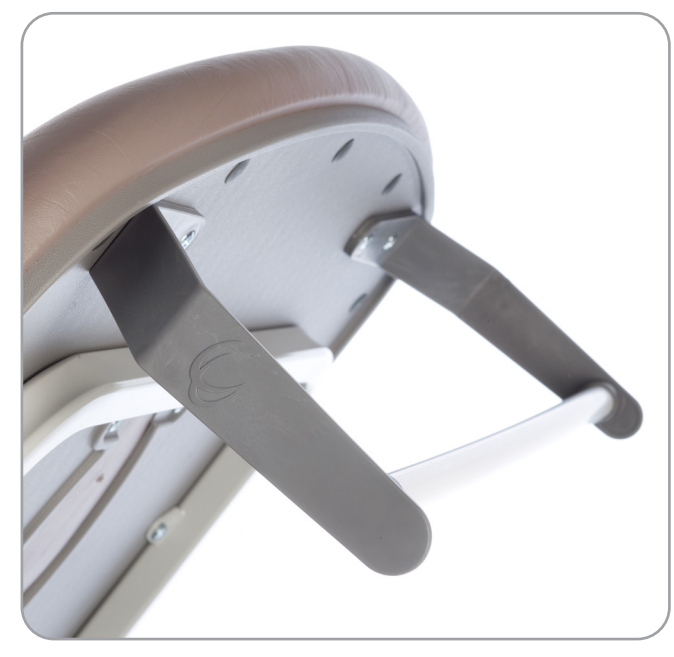
Paper Roll Holder Fitted as Standard